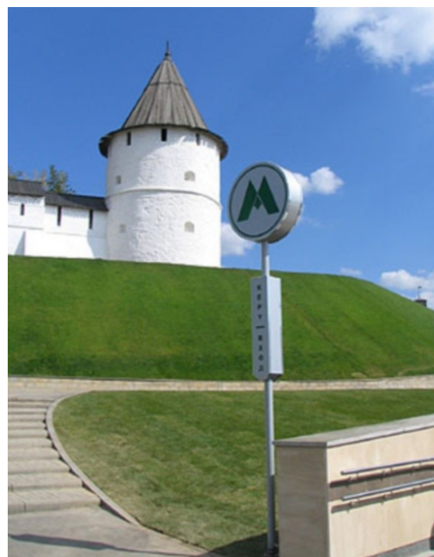
The tunnel boring equipment starts its journey on a barge in France (left) and ends up extending the metro underneath the central Asian city of Kazan in the republic of Tatarstan, the seventh-biggest city in Russia.

Moscow-based Alfa Logistics has organized the transshipment of a tunnel-boring machine (TBM) from the Le Creusot, France, headquarters of NFM Technologies to Kazan in the Russian republic of Tatarstan. The cargo will land at Rostov from where it will be onshipped to Kazan, where it will be used for tunnelling the extension to the Kazan subway.