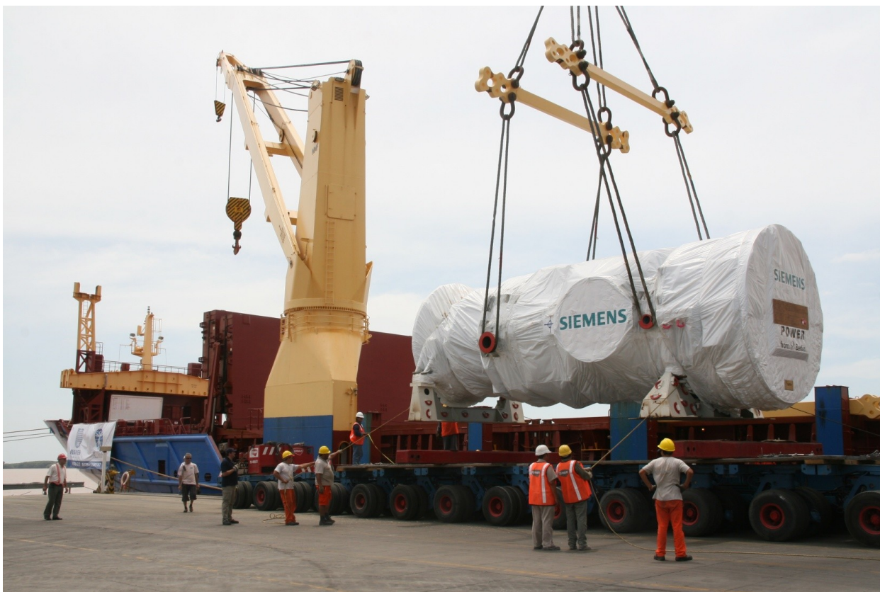
Waiver arranges the handling of Siemens generators and turbines for the Pilar thermal power plant in Argentina.

In 2009, Waiver has worked with other GPLN members on a number of important projects in the energy sector.