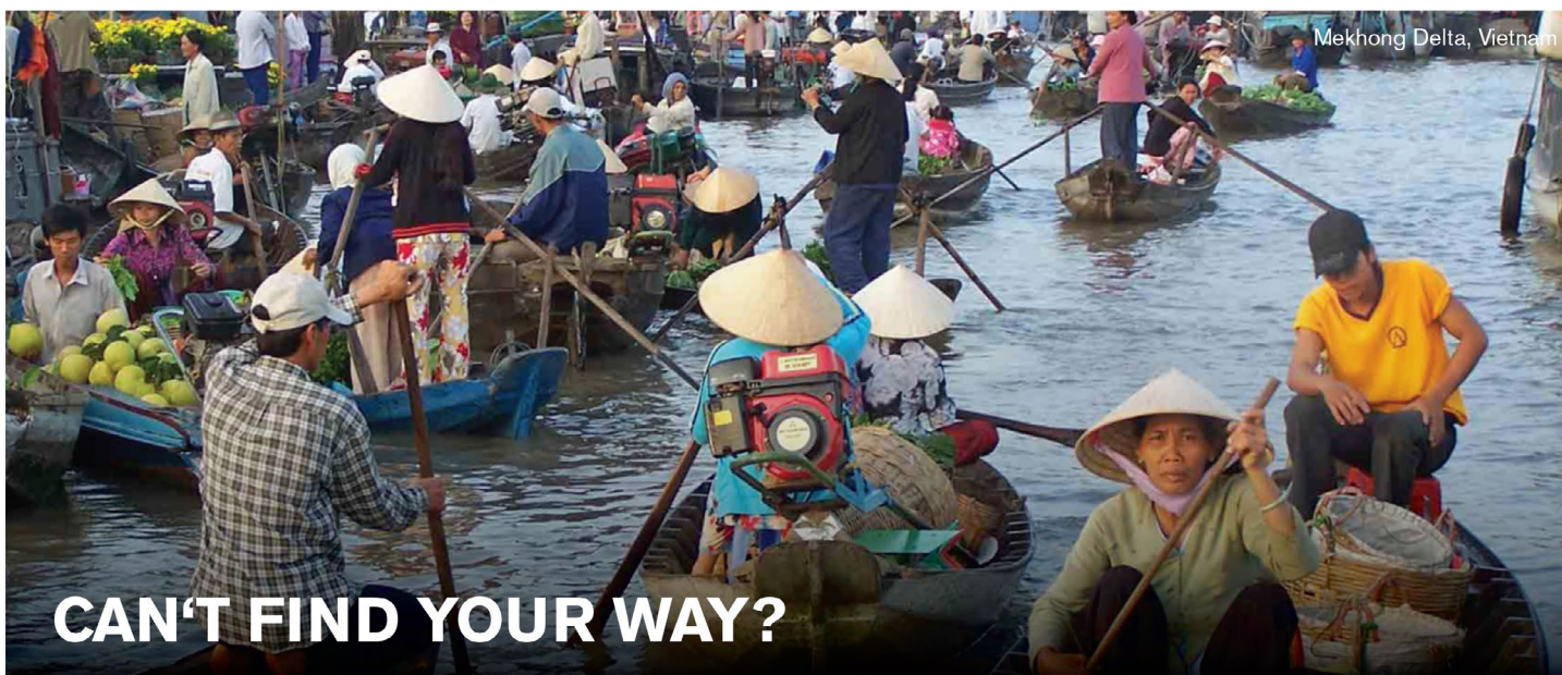
Mekhong Delta, Vietnam

A big thank you to our team and trusted partners for their exceptional contributions!